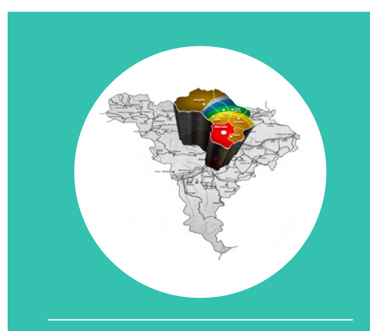
Figure 1. Smart Move in the Metropolitan Area of Alba Iulia project area, with tariff zones

The project offers a service with increased reliability, more accessible spatially and financially, better adapted and more flexible to the community's needs. Several gaps from the prior transport offer were eliminated: lack of integration of timetables for urban and rural services, limited stops in the city, lack of authority for approving or changing rural routes and for adjusting the transport fares or providing subsidies.